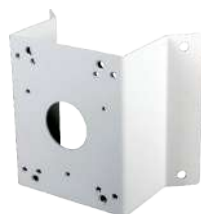
A35 Corner Mount