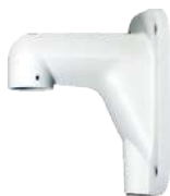
A21 Corner Pole Mount