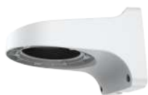
A29 Wall Mount