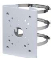
A36 Pole Mount