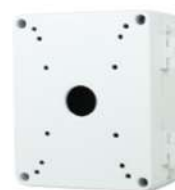
811 Junction Box