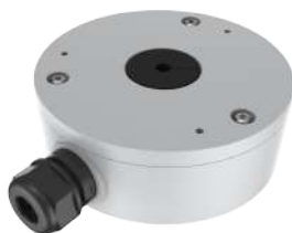
TC-P54BM SPEC: V5 JUNCTION BOX