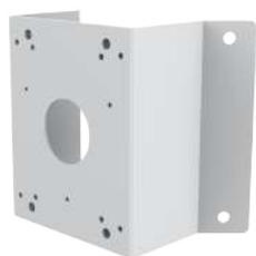
A35 CORNER MOUNT