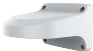
A29 A29 WALL MOUNT