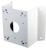
A35 Corner Mount