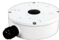
A22 Junction Box