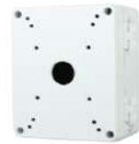
811 Junction Box