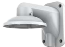
A25 Corner/Pole Mount