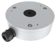
TC-P548BM Spec: V1 Junction Box