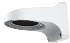
A28 Wall Mount