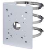
A36 Pole Mount