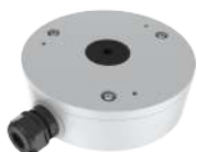
TC-P548BM Spec: V1 Junction Box