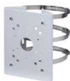
A36 Pole Mount