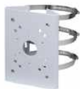
A36 Pole Mount