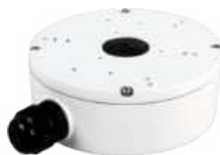
A22 Junction Box