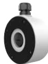
TC-P54AM Spec:V4 Junction Box