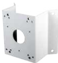
A35 Corner Mount