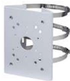
A36 Pole Mount