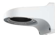
A28 Wall Mount