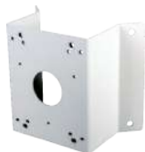
A35 Corner Mount