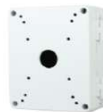
811 Junction Box