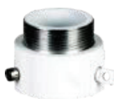
A37 Installation Adapter