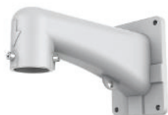
DF20Y Wall Mount